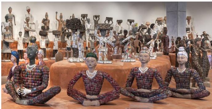
3 rd floor India art sculptures

We could have stayed there for many more hours just looking at all the different types of art and materials used by the American Artists on the first floor, paintings, etc. on the second floor, and the India sculptures on the third floor.