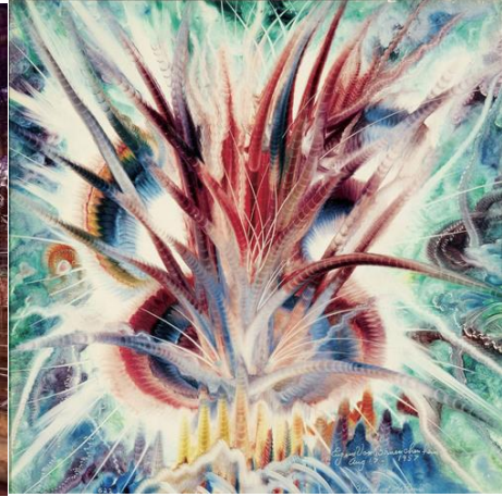
Some of the art work on the first and 3 rd floors. Left-tin art right-painting