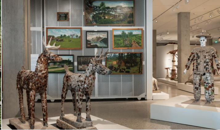
Grottos and stone statues