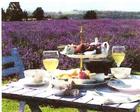
6. POP-UP EVENT HIGH TEA AT 3 IN THE LAVENDER FIELD 3-COURSES WITH TEA & WINE PAIRINGS 50