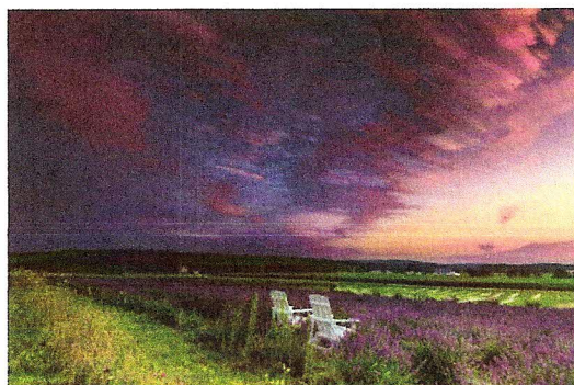
8. WHAT A FANTASTIC WAY TO END YOUR DAY. A PICNIC IN THE LAVENDER FIELD, A SALUTE TO THE SUNSET TOAST--FIRE THROWER CEREMONY & SUNSET GAZING 50