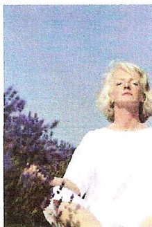
7. GUIDED QUIET MEDITATION IN THE OUTDOOR CLASSROOM WITH BUDDHIST MONK (MINIMUM OF 12 PEOPLE) 15