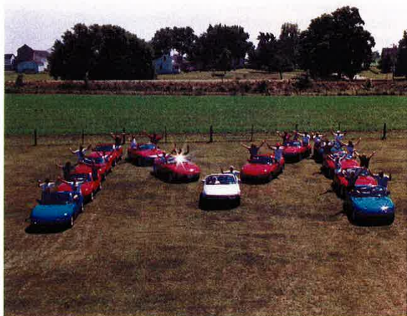
The beginning of the August 91' tour of Lake Geneva